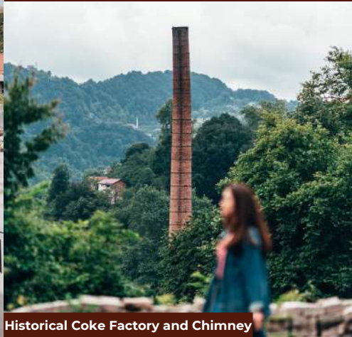
Historical Coke Factory and Chimney