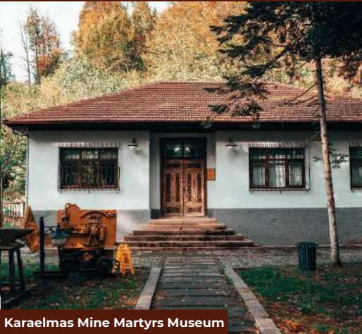
Karaelmas Mine Martyrs Museum