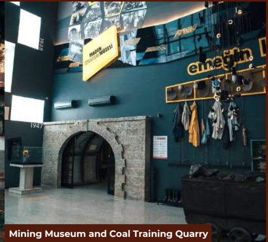
Mining Museum and Coal Training Quarry