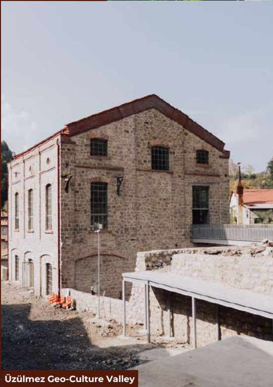
Üzülmez Geo-Culture Valley