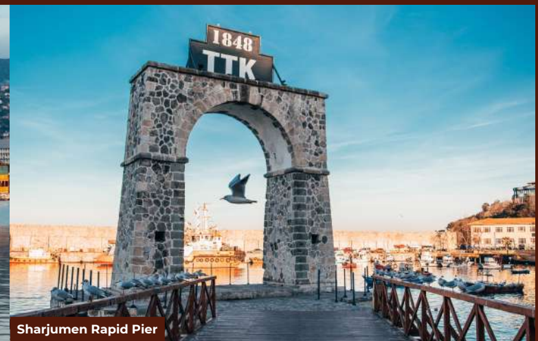
Sharjumen Rapid Pier