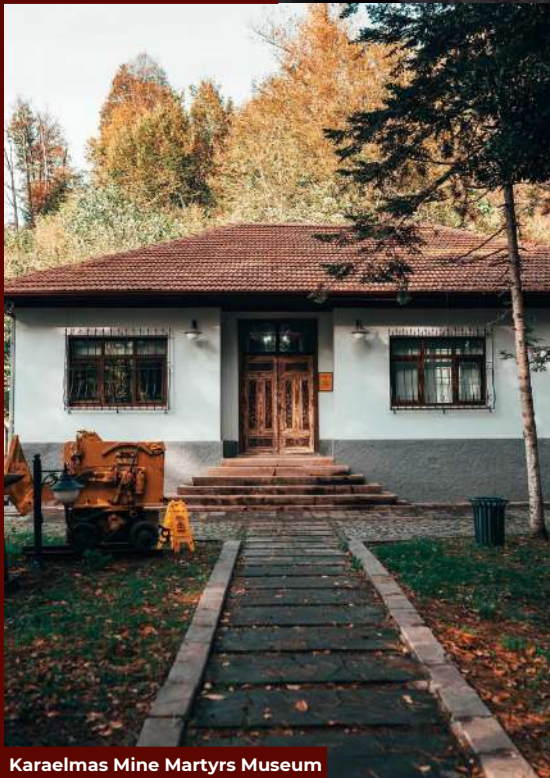
Karaelmas Mine Martyrs Museum