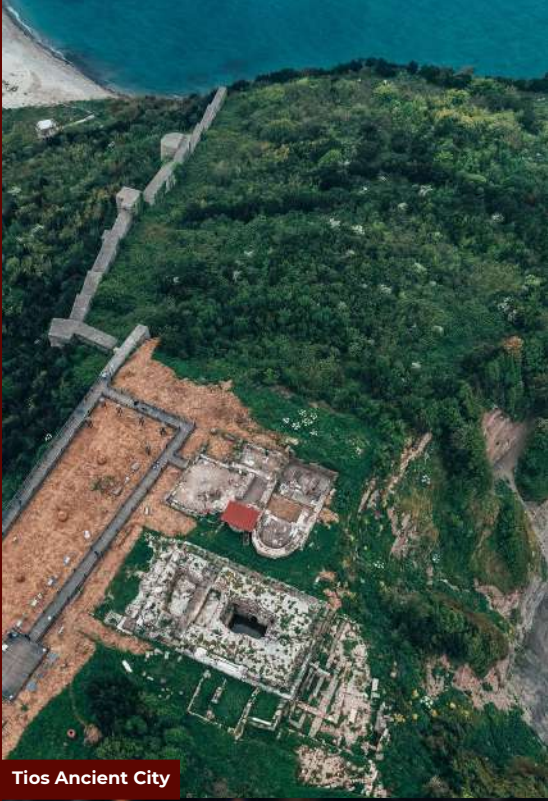
Tios Ancient City