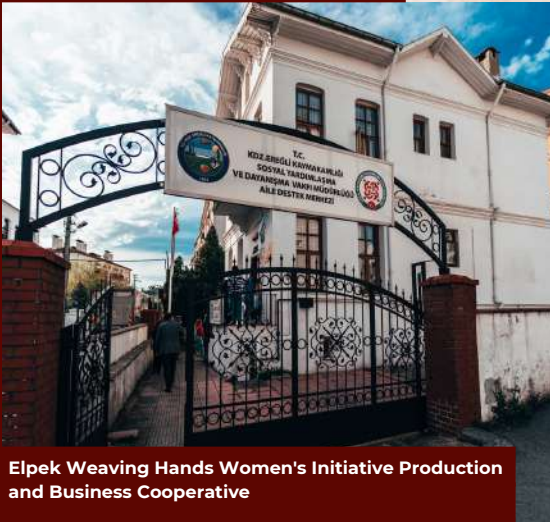
Elpek Weaving Hands Women's Initiative Production and Business Cooperative