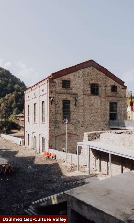
Üzülmez Geo-Culture Valley