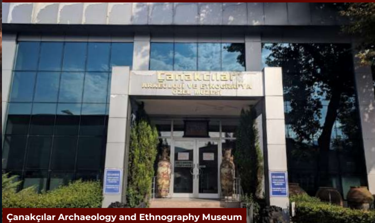
Çanakçılar Archaeology and Ethnography Museum