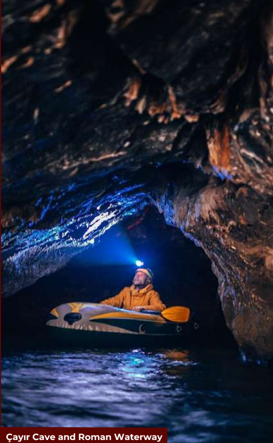
Çayır Cave and Roman Waterway

Çanakçılar Archaeology and Ethnography Museum