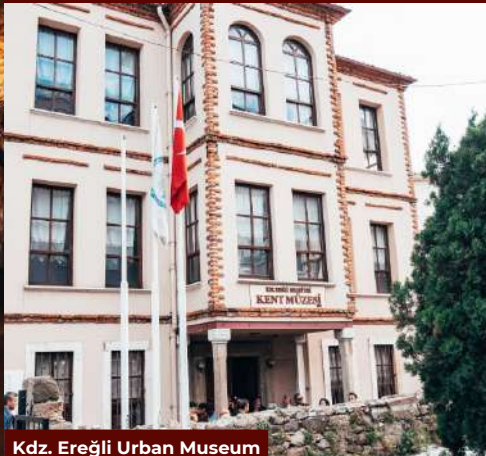
Kdz. Ereğli Urban Museum