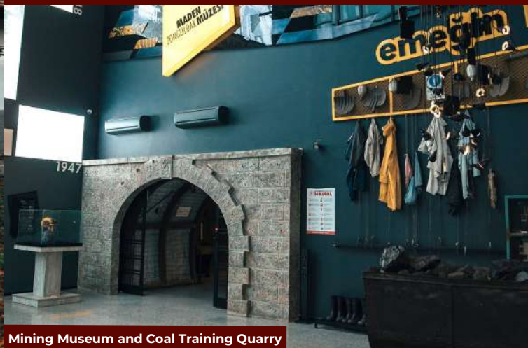
Mining Museum and Coal Training Quarry