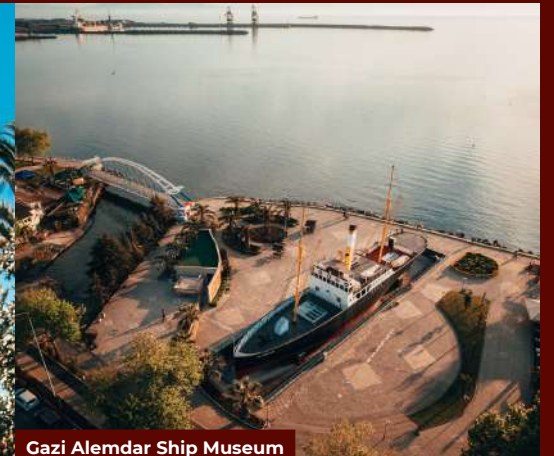
Gazi Alemdar Ship Museum