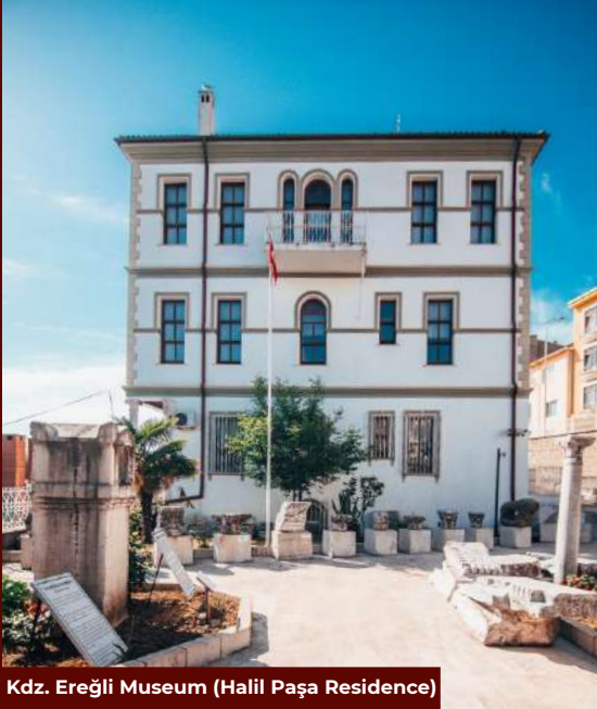
Kdz. Ereğli Museum (Halil Paşa Residence)